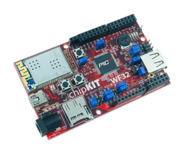
The WF32 board.

The WF32 is based on the popular Arduino™ open-source hardware prototyping platform and adds the performance of the Microchip PIC32 microcontroller. The WF32 is the first board from Digilent to have a WiFi MRF24 and SD card on the board both with dedicated signals. The WF32 board takes advantage of the powerful PIC32MX695F512L microcontroller. This microcontroller features a 32-bit MIPS processor core running at 80Mhz, 512K of flash program memory, and 128K of SRAM data memory.